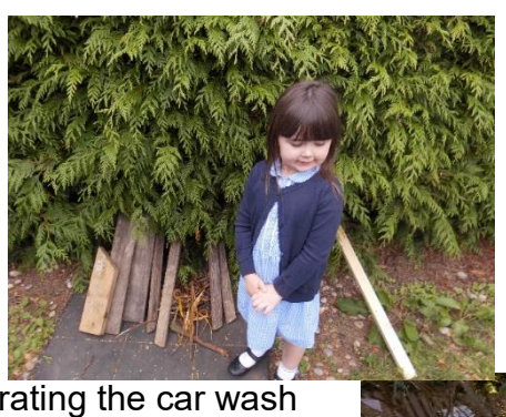
Building hedgehog homes